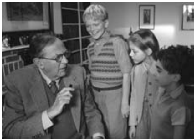
Anton Rodgers as C.S. Lewis.