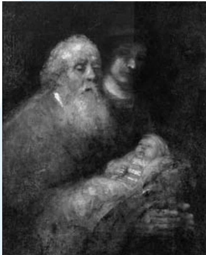
Rembrandt Nunc Dimittis (Simeon Holding the Christ Child) c.1669

There is something here for the artist as well. Artistry that is exercised in the context of faith is never to be simply – self expression. It always involves a gesture toward a