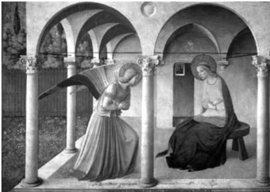
Fra Angelico Annunciation c.1450

The recent film Babel serves as a stark reminder of the divides that characterize our globalized world and our personal lives. Our communication is somehow blocked and in our failure to understand divisions deepen. Art cannot solve this problem, but perhaps like this film, it can get us to attend more carefully and see a little more clearly.